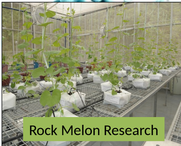
Rock Melon Research