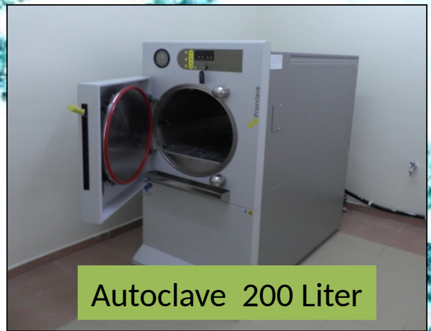
Autoclave 200 Liter